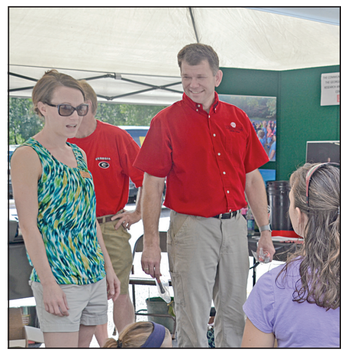
The Georgia Mountain Research and Education Center, aka the Experiment Station in Union County, set up an informational booth with activities for kids and market-goers at the Union County Farmers Market on Aug. 13.