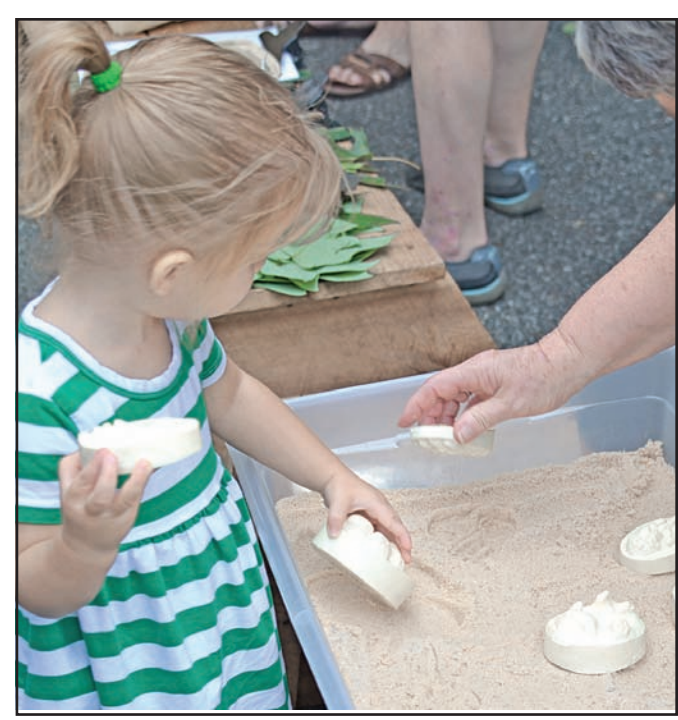
This little girl learns about fossil imprints at the Farmers Market on Saturday, Aug. 13, from a volunteer with the Georgia Mountain Research and Education Center.