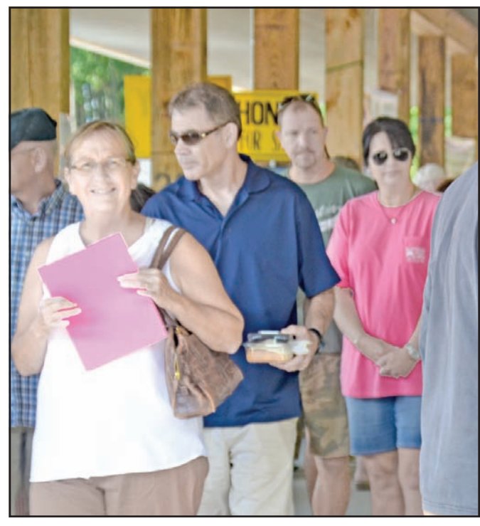
As usual, the Union County Farmers Market bustled with excitement on Saturday, Aug. 13, for fresh produce and homemade goods